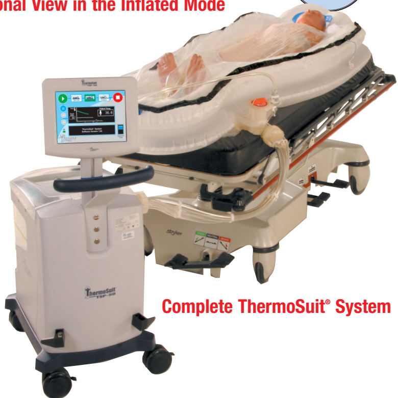
Complete ThermoSuit® System

No Hospital Should be Without The ThermoSuit® System!